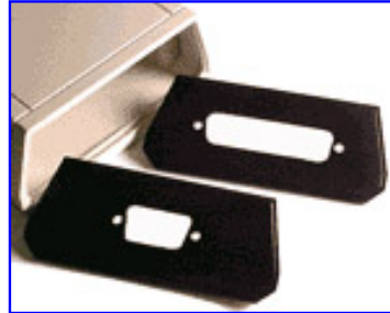
DB 9 and DB 25 Pin Cutouts