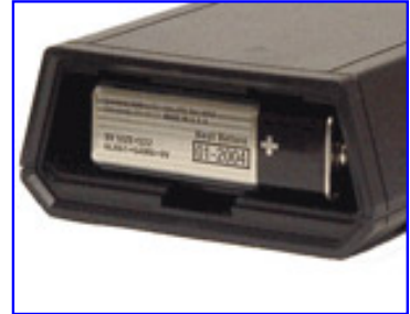
9V Battery Compartment