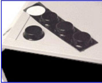
Non-Skid Feet (P/N 51)